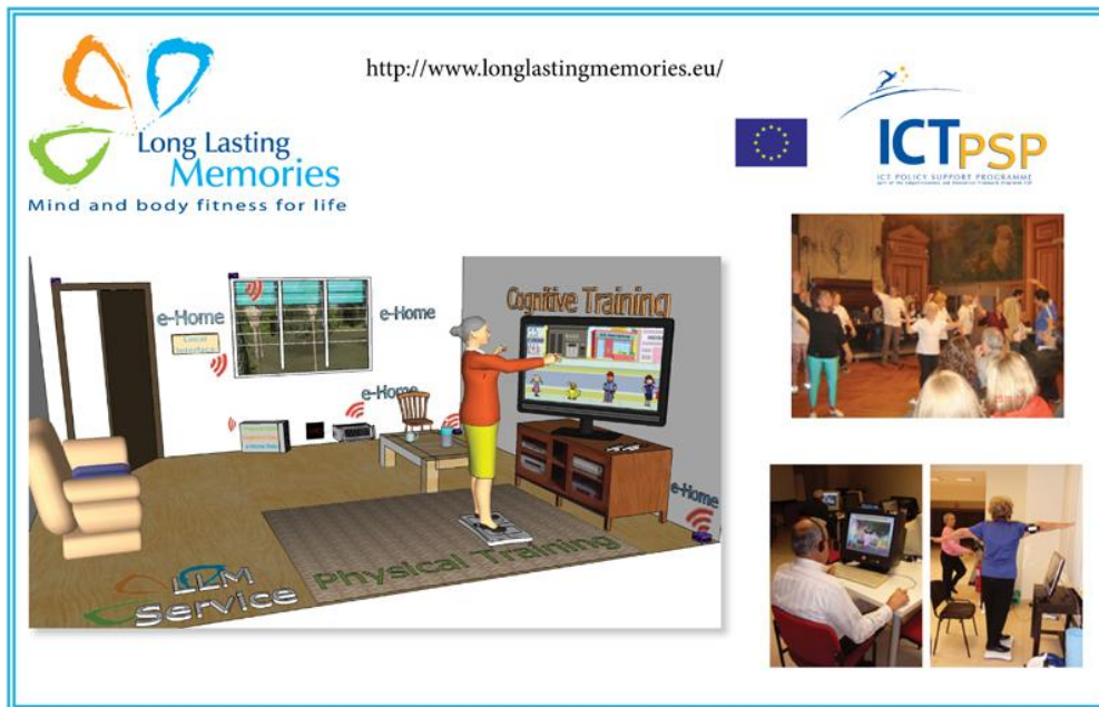
Figure 1: LLM service

The LLM service is designed to comprise of three existing interoperable components which perform complementary and interactive tasks to provide the system's services: